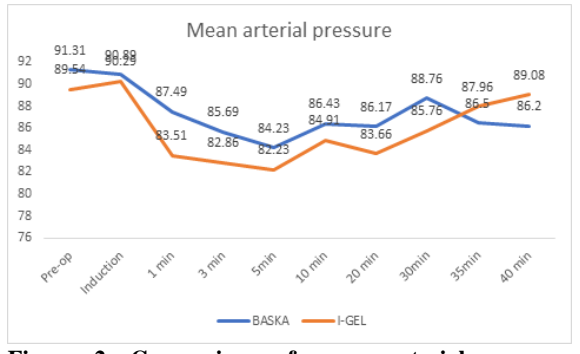
Figure 2. Comparison of mean arterial pressure between groups

There was a statistically significant difference in the ease of intubation between the groups (54.3% in the BASKA group and 94.3% in the I-gel group). The number of successful intubation attempts also differed significantly, with 64.7% in the I-gel group succeeding in one attempt, while 88.9% in the BASKA group required two attempts.